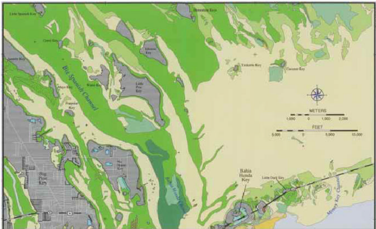
Figure 1 – A map showing benthic habitats near Big Pine Key Florida. Habitats were classified into 24 different types by marine ecologists. Their boundaries were then geo-referenced and incorporated into a GIS database.

In 1998, NOAA and the Florida Department of Environmental Protection produced a CD-ROM of the Benthic Habitats of the Florida Keys (NOAA 1998). The Atlas contains color imagery and GIS files that describe and show the location of shallow seafloor habitats, such as coral reefs (See Figure 1). In cooperation with the Center for Coastal and Ocean Mapping – Joint Hydrographic Center (CCOM-JHC) at the University of New Hampshire, CARIS ® prepared a brief report on how this benthic habitat mapping data could be converted into IHO S-57 feature objects using CARIS HOM ENC software tools (Duguid 2004). The process described in the report clearly indicates that ArcView ® “Shapefile” data can be used to create IHO S-57 objects, but that further testing/refinement is needed to develop new IHO S-57 objects classes for coral reef habitats. These new MIOs would also need to have suitable attributes to describe the different coral reef habitat designations, and for any other criteria related to regulated activities.